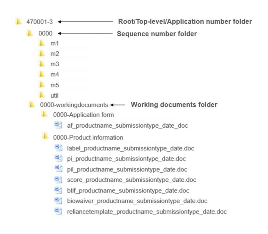
Figure 3: Location of working documents